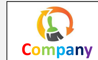
ImageFile3.png 200 pixels tall x 400 pixels wide